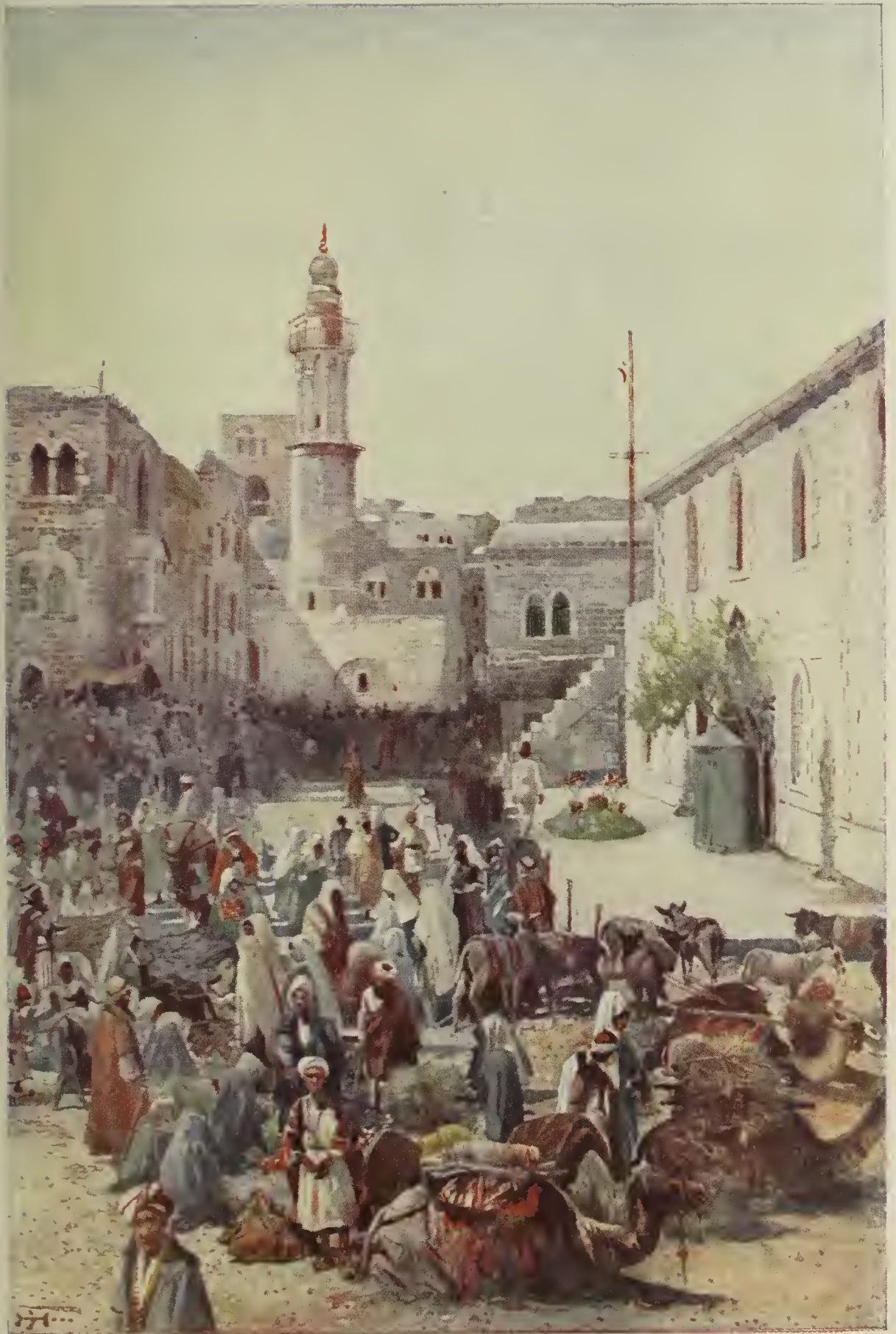
The Market-place, Bethlehem.